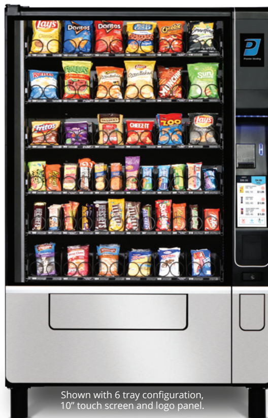
Shown with 6 tray configuration, 10" touch screen and logo panel.

Easy access to systems for restocking, currency collection, pricing and standard maintenance. - 90 degree lock with 4 point latch system - Separate product and control system areas - Intuitive service menu system