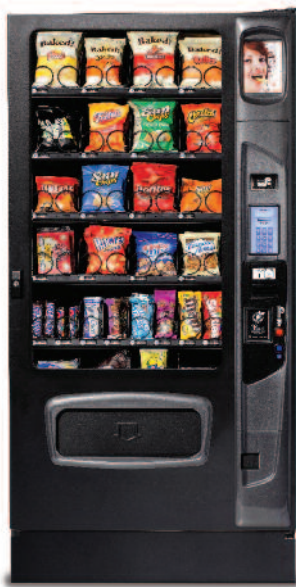
M4000 Shown with optional ADA door, iCart touch screen & kick panel.