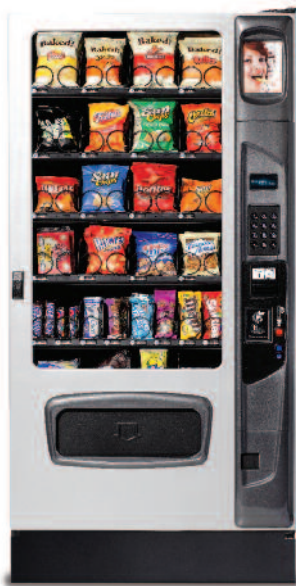
M4000 Shown with optional ADA door, custom door color & kick panel.